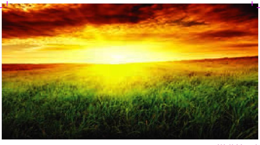
Wall Mural 3" Bleed